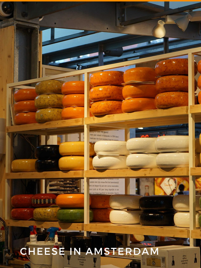
CHEESE IN AMSTERDAM